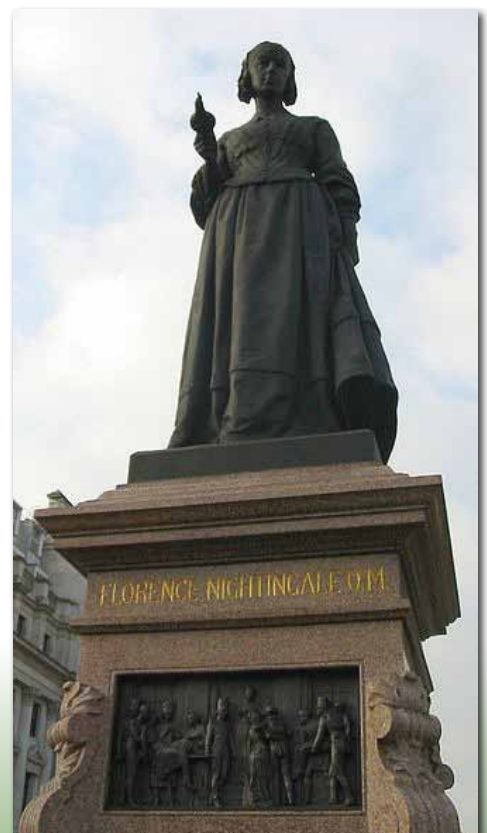
Above left: The 2010 Albany Service Flyer. At right: Florence Nightingale, Trafalgar Square

She existed in the realm of Western mysticism, where God is the other and one seeks unity of purpose with God. In this tradition the highest forms of Divine Union impel and almost propel the self to some sort of active rather than passive life, often a super human activity.