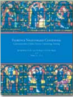
At left

She was by all accounts a woman of action – and one deeply frustrated and sometimes furious when action was not taken soon enough. No doubt love of God and love of man was the motivation for all her actions. Her mandate is seen in the roots of the Gospel Matthew 25. Perhaps her spiritual torment stemmed from her unwillingness to recognize ... “the simplicity of God’s love.”