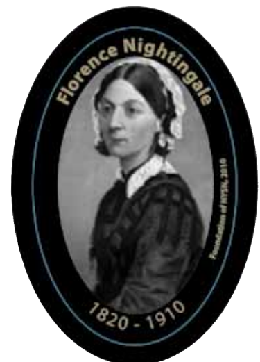
Florence Nightingale Collector’s Pin

Foundation of New York State Nurses Bellevue Alumnae Center for Nursing History 2113 Western Avenue, Suite 1 Guilderland, New York 12084-9559 Telephone (518) 456-7858 FAX (518) 452-3760 Email: mail@FoundationNYSNurses.org ☺